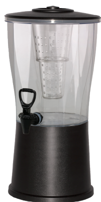
CBDRT3BL 3 Gallon Dispenser