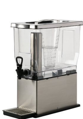
CBDT3SS Cold Beverage Dispenser