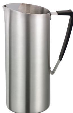
X7DWBS Stainless Slim Pitcher