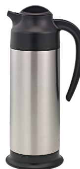
SSN100 SteelVac® Cream- ers