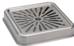
DTSQ6SS Square Drip Tray