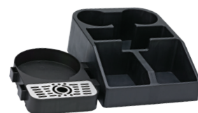
APC5 + APDT1BL Condiment Station & Airpot Drip Tray