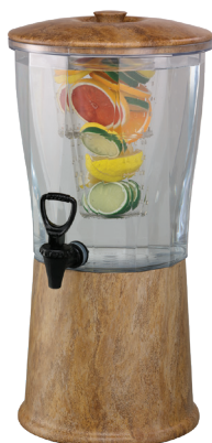
CBDRT3SSMB Cold Beverage Dispenser