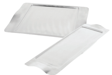
SB-41, SB-42, SB-43 Mod 18 Stainless Trays