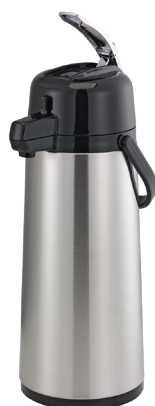
ECALS22S Eco-Air® Stainless Airpots