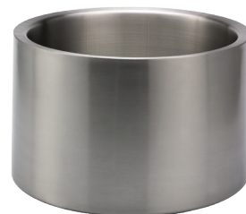
PT7BS Beverage Party Tub