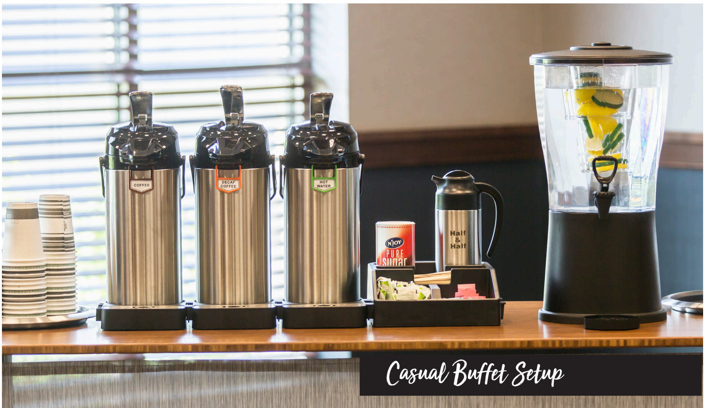
Casual Buffet Setup

Products: APC716BS, CBDRT3SS, ALTU06BS, DTSQ6SS, SB-41, SB-43, SB-70, SB-72, 1C-BF-__-MOD