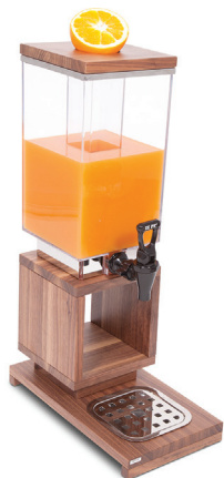
15S00011 Zepe Woodline Dispenser