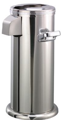
APC716BS Brushed Airpot Cover-Ups