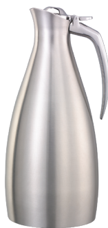
ALTU10BS Altus Carafe