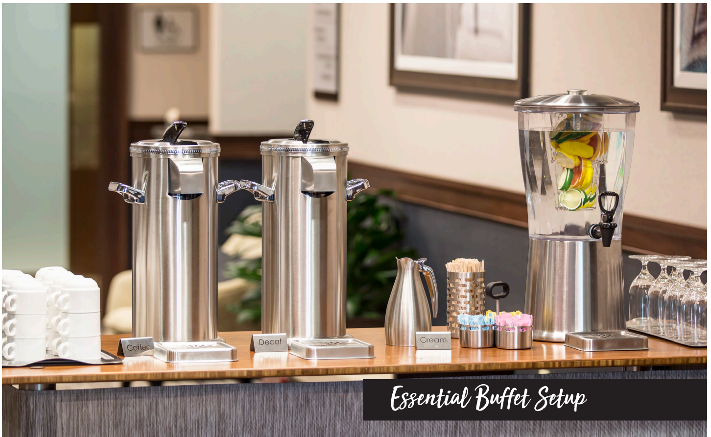
Essential Buffet Setup

Products: APC716BS, CBDRT3SS, ALTU06BS, DTSQ6SS, SB-41, SB-43, SB-70, SB-72, 1C-BF-__-MOD