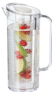
NEPH02-1 Flavor Infusion Pitcher