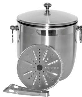
IB3BS Stainless Ice Bucket